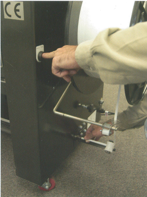
Push-button Auto Load feature